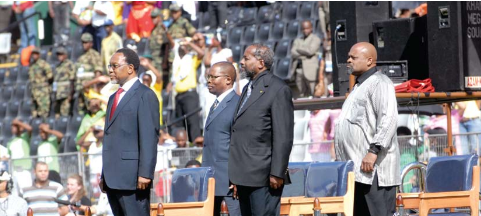
Deputy President (then President) Kgalema Motlanthe, then Premier Sbusiso Ndebele, then Minister of Arts and Culture Dr Pallo Jordan and Ethekwini Mayor Obed Mlaba at the National Freedom Day celebration in Durban