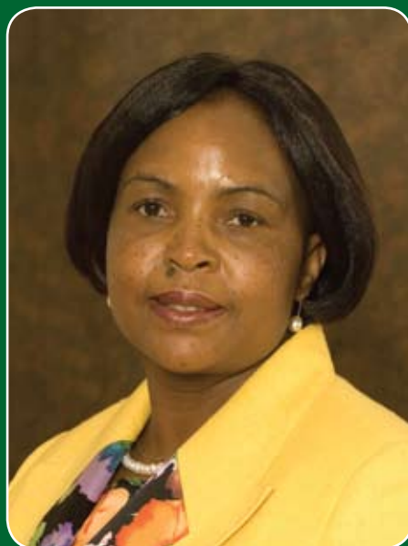
Minister Maite Nkoana-Mashabane