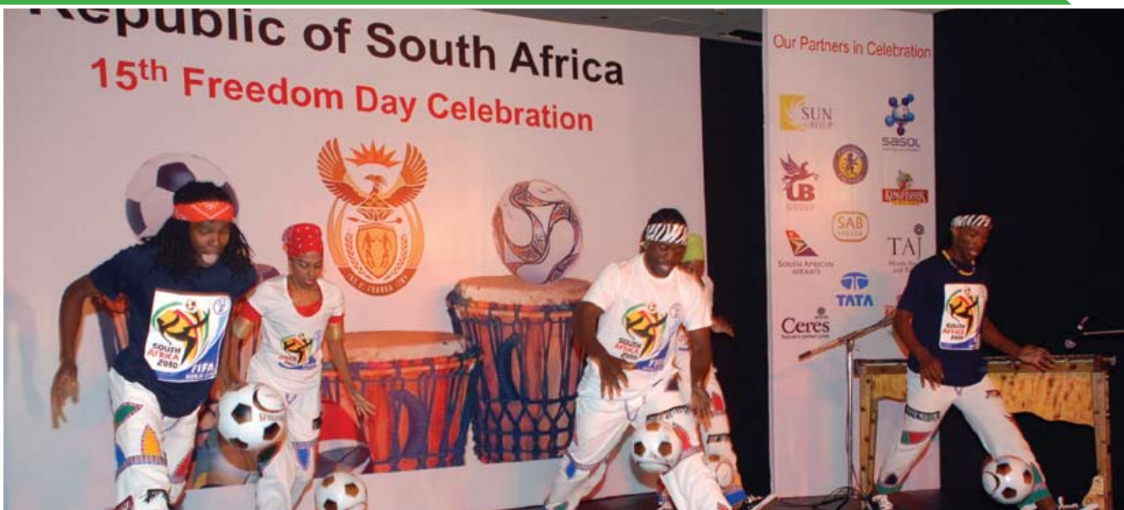
Dancers from the Tribhangi Dance Theatre performing in Delhi, during National Day Celebration

The two events celebrating 15 years of freedom and democracy in South Africa were well attended by Ambassadors, officials of the European Commission, ACP, Belgium, Flanders and Luxembourg, members of the Diplomatic Corps, friends of South Africa, as well as South African nationals residing and working in Belgium and Luxembourg. They were all treated to a nice surprise when the 2010 FIFA World Cup Mascot, Zakumi, made an appearance.