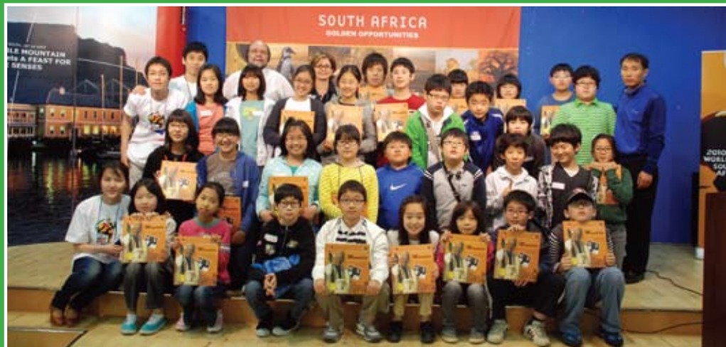
Korean school children participating in the SA Week activities

The rest of the story will be told by the pictures. It is safe to say the Mission will continue to explore creative ways of making sure that people who live in its sphere of operation get a constant reminder about both the 2009 Confederations Cup and the 2010 FIFA World Cup. The aim is to make them take the logical decision – attend these FIFA tournaments hosted by a country that is alive with possibilities. All we can say in isiZulu is: Woza 2009 Confederations Cup, nawe 2010 FIFA World Cup!!!