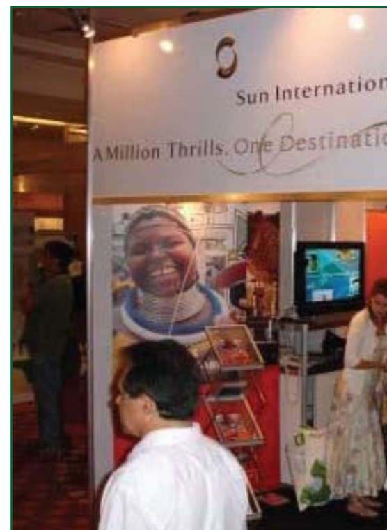
The Embassy Stand where staff attended to prospective travellers